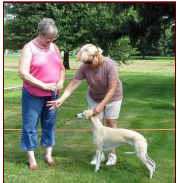
Saturday match winner Twee

We are also very happy to report that there were no injuries or casualties due to the