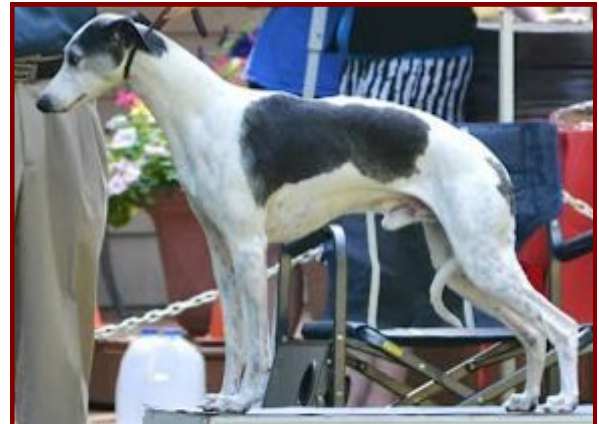
CanCh Kindred Monarch Rules FCh

The 7-10 Bitch class of 10 was quite a challenge. This was a group of very deserving bitches. My First Place winner, Am/Can Ch Nouveau's Awfully Pretty FCh , was a very fit, black satin coated, beautifully presented bitch of outstanding type. She was rather straight in front, but with correctly bent pasterns. In spite of that, her movement was effortless. She was what I call a one-fault dog. She won this very competitive class due to her abundance of virtues, and my belief that straighter shoulders rarely im-