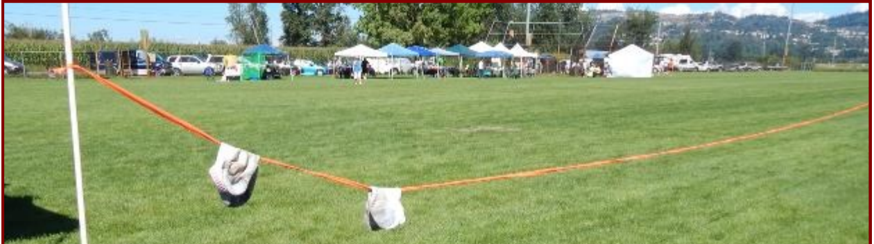
Still life with wet socks

job setting the scene for a very authentic Vancouver weather (clouds/mist/rain/sun). Thankfully the sun did make an appearance in time for lunch and the rest of the day's events.