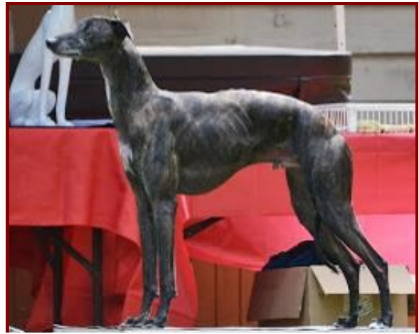
The Mighty Bolt of WyndSOR ARX SRA PR4 ORC

The next class was the Race Ch class. First place went to the mahogany brindle The Mighty Bolt of WyndSOR ARX SRA PR4 ORC . He was a big, leggy dog whose presence was undeniable. His proportions weren't perfect and his angles rather straight (but balanced), yet he was a stallion of a dog in incredible condition. I remember commenting that this is what speed looks like—I guess I was right about that because he finished the weekend by winning the National Race Meet undefeated.