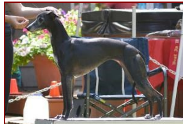
Am/Can Ch Nouveau's Awfully Pretty FCh