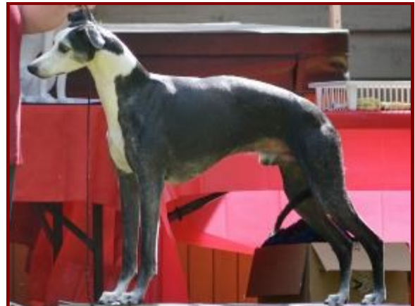
Serendipity Nighthawk ARX DPCX TRPX PR6 FCh

The DPCX class was a tough one because all of the dogs were so different. First went to the black and white Serendipity Nighthawk ARX DPCX PR6 FCh SRM OTRM2 TRPX CGC on the basis of his complimentary angles front and rear, nice and smooth "S" curved outline and underline and his overall soundness. He could have used more neck and elegance, but he was an honest, good moving dog. Second went to AmCh Wegner's Fly Me To The Moon ARX DPCX TRP , an elegant, smooth and sound dog of good quality. The placements were close, but I preferred the bone and the slightly more angled front of #1. Third and fourth were excellent, upstanding powerful dogs. I felt that both of them could have had their fronts set under them a little more, but both were very handsome and masculine.