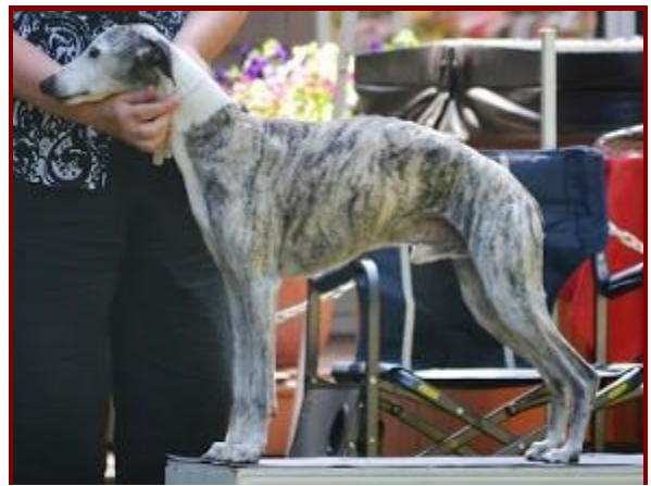
AmCh Bayleaf Black Mustard FCh TRPX DPD CGC