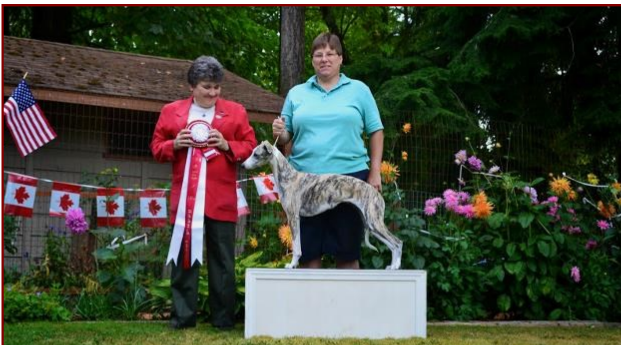
Best Puppy: Snow Hill Mind Over Matter