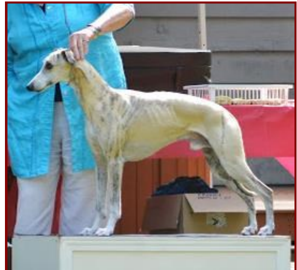
Am/Can Ch. Whimsy's Over The Moon TRP DPC PR

Second to him was CanCh Counterpoint the Painted Abbey TRP DPC PR , a striking,