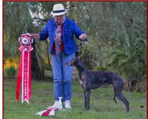
National Meet Winner — Bolt

We did break for lunch between the third and fourth program. In usual Racing for Food fashion we had a top-notch spread of salads, desserts and appetizers to go with chicken salad sandwiches. Everyone had very full plates and despite our fears coming into the weekend that we would not have enough food to go around, there was no shortage of food.