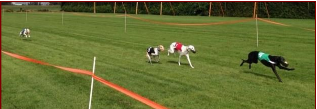
Coalby winning the Legends race