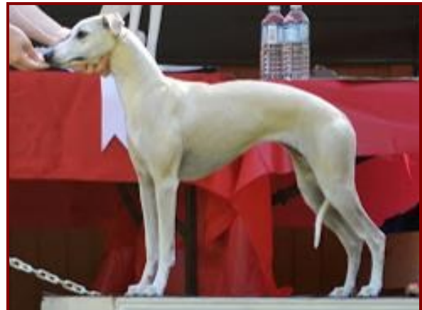
Specially Precious Forbidden Fruit

Both Bench Ch bitches were of extremely high quality. I gave the nod to Am/CanGCh Whimsy's Swiftsure Kilo Kai TRP DPC PR , a fawn brindle and white sister to Cruzan Gold. Kai was an exceptional bitch. She was perhaps a little more bitch than I usually prefer, but so very well-made. She was clean and smooth with great angles. Structurally she was close to flawless, and her foot timing was impeccable. There was little I would have changed about her, maybe given her a little more reach in front and a touch more refinement. The bitch she de-