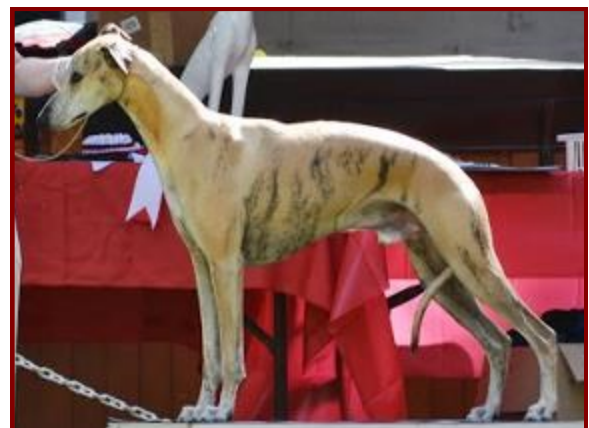
Am/Can Ch Whimsy's Swiftsure Cruzan Gold

The winner of the Altered Male class was another one of my favorite dogs of the day. The orange brindle Am/Can Ch Whimsy's Swiftsure Cruzan Gold was a big dog, and oh so impressive. He was a dog I would breed to if he weren't altered! I felt he had