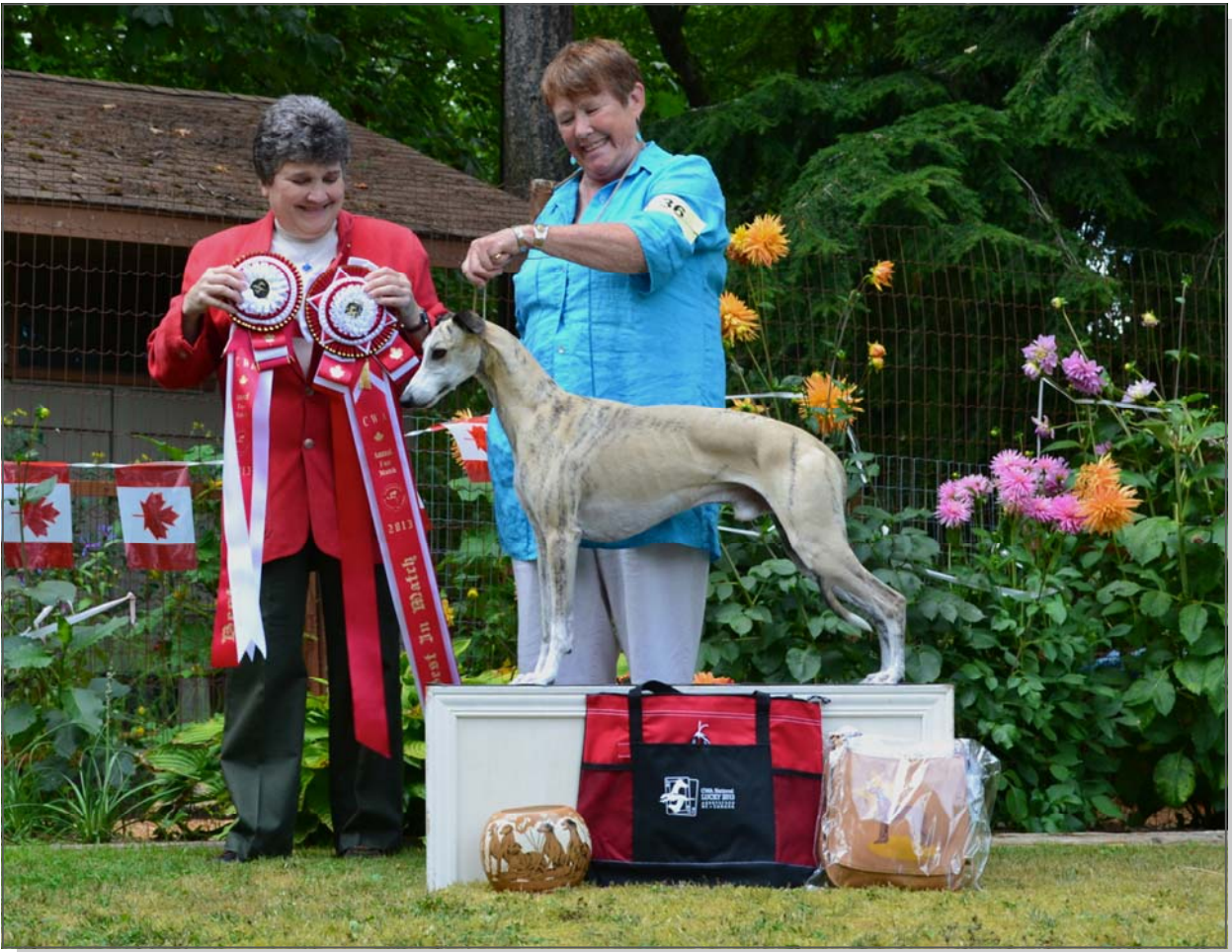
CWA National Match Winner ~ 2013