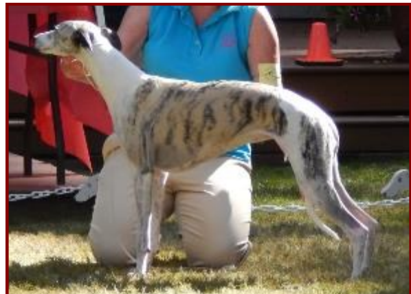
Am/CanGCh Whimsy's Swiftsure Kilo Kai TRP DPC PR