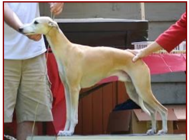
Kimera's Panama Red