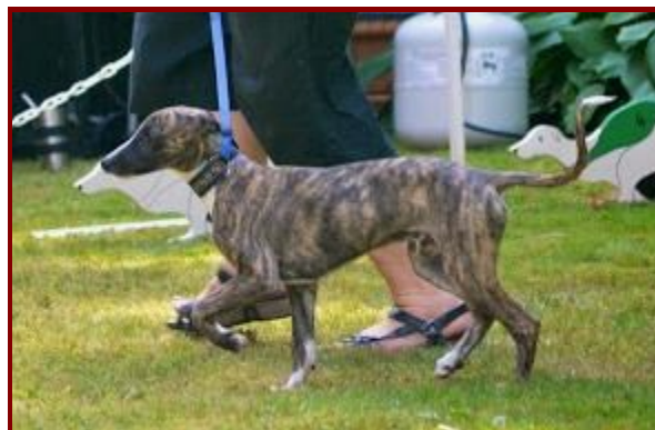
Nonstopp Frehley's Comet

From there we started on the puppies. The first class was a single baby boy of barely 3 months, Nonstopp Frehley's Comet , a charming little brindle guy with a wonderful temperament, nice free movement, and balanced front and rear. He has a bright future.