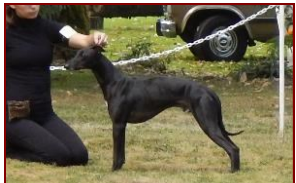
Nouveau's Le Chat Noir