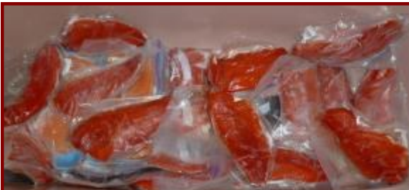
Salmon waiting to hit the grill!

Once everything was wrapped up at the field it was time to head back to Camp Swiftsure for the Salmon BBQ feast and awards presentation. Of course there was another stunning spread of food to stuff our selves with. Thank you to our BBQ chefs for doing such a great job cooking everything to perfection.