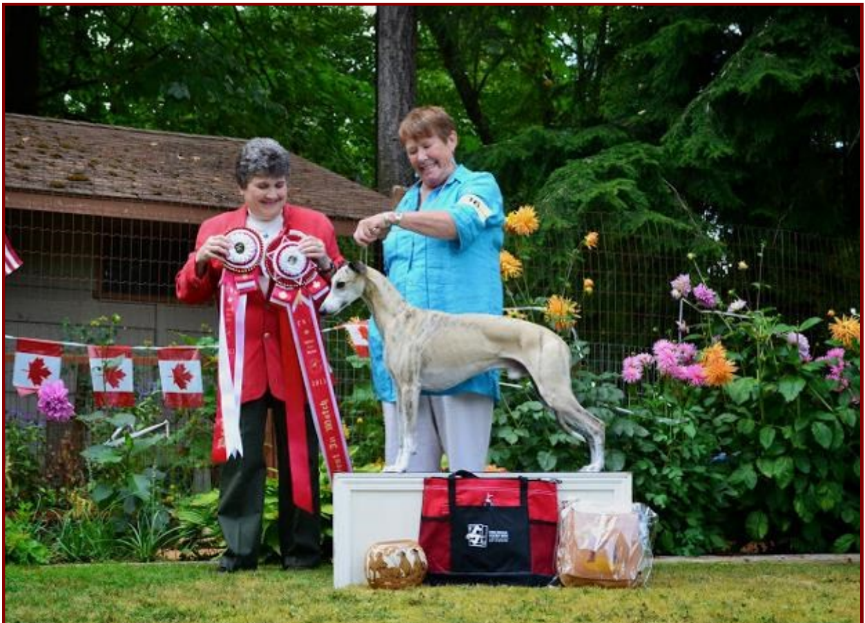
Best in Match: Am/CanCh Whimsy's Over The Moon, TRP DPC PR