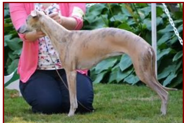
Highbridge Carrera ARX TRP PR