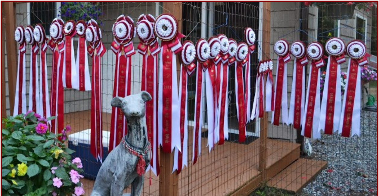
Beautiful and highly coveted rosettes supplied by Regal Rosettes of FL.