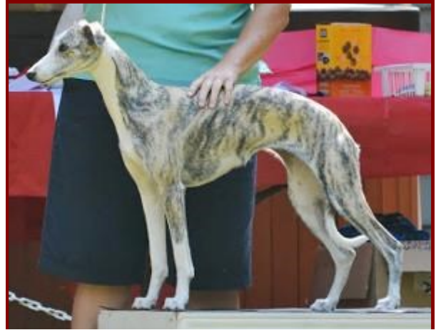
Snow Hill Mind Over Matter

There were four Open dogs and I liked every one of them. My ultimate placements came down to proportions and/or smooth move-