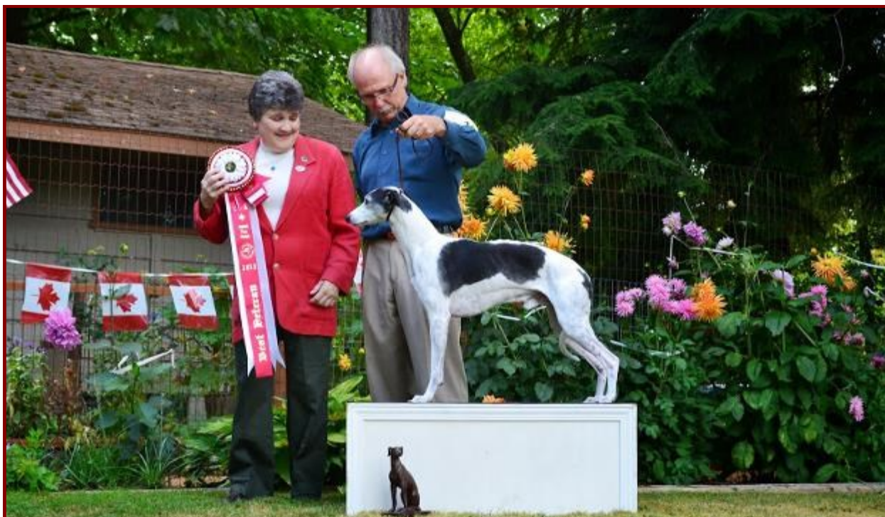
Best Veteran: CanCh Kindred Monarch Rules FCh