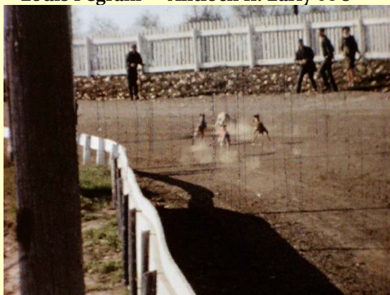
Marysville, Oh. 1965 Notice the hand crank lure