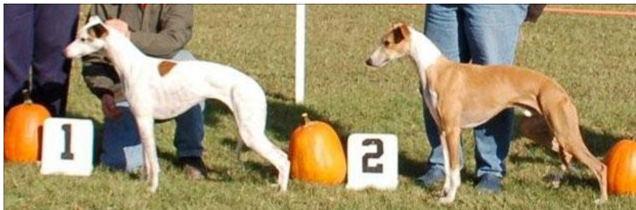
#1 Racing and #2 Conformation: Cogshall's Spider Lily of Coswin ARX DPCX SRA2 CR (left) #1 Conformation: Marial's Mosinee of Cogshall ARX DPCX (right)