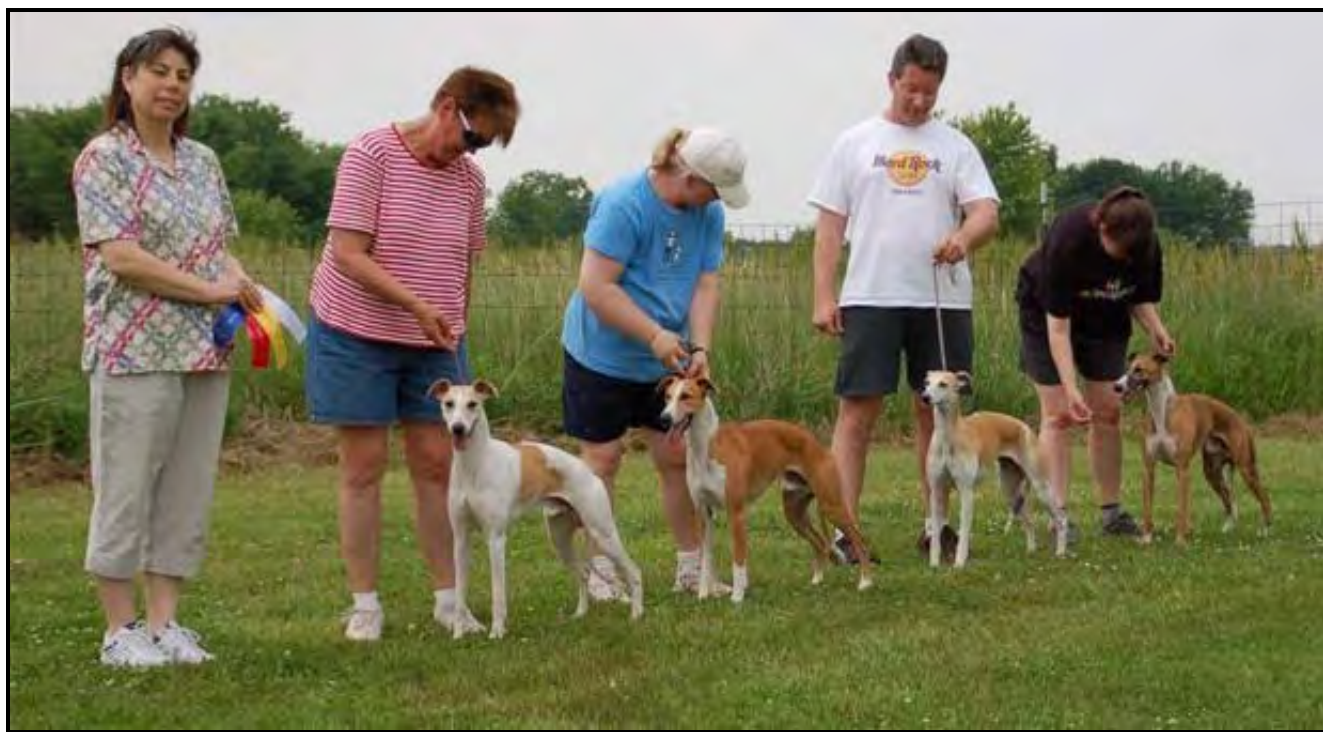
Sunday Conformation – Pibb, Moses, Jessie, Sawyer