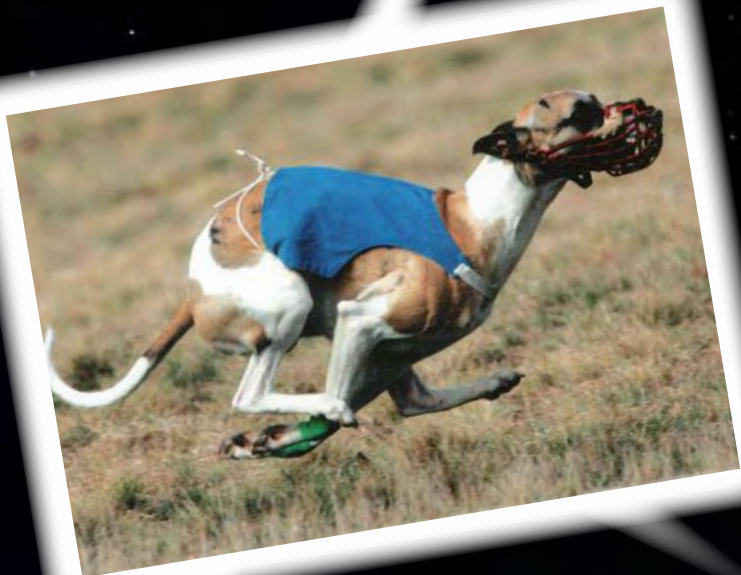
2009 ASFA Gillette Cup Winner & II BOB Ch. Surrey Hill's Galafrey ARX DPCX LCM OTRM CR "Bonzer"