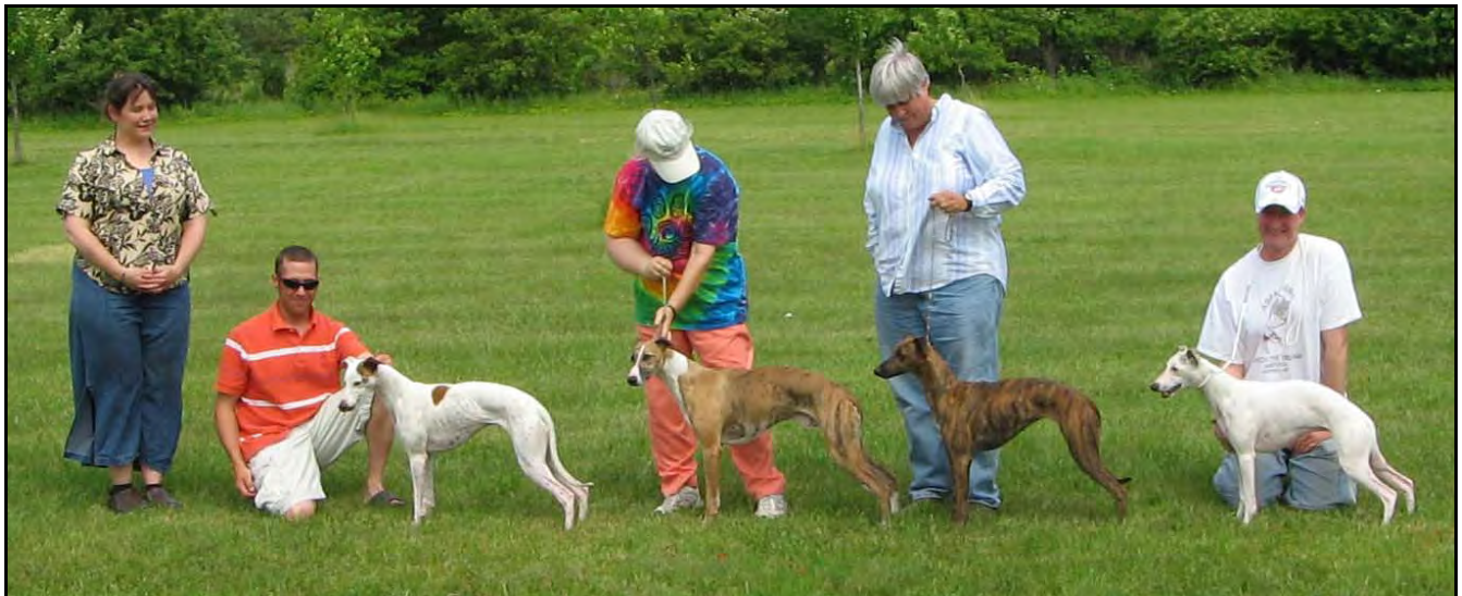
1 st : Charlotte, 2 nd : Sawyer, 3 rd : Minnie D, 4 th : Phoebe