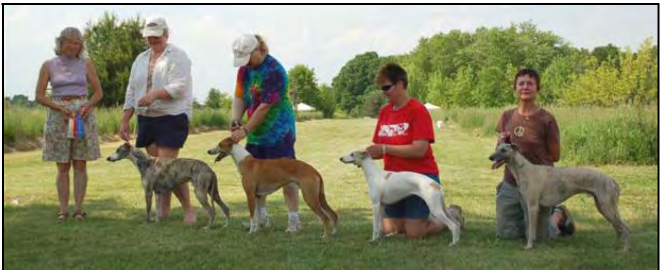
Saturday Conformation – Moto, Moses, Fanta, Dickens