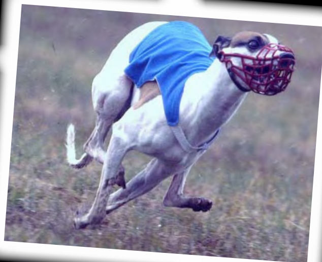
Multi-Meet Winning Capetown American Legacy ARX CRX3 OTRM2 (ORC/NORC-ptd) "Meghan"