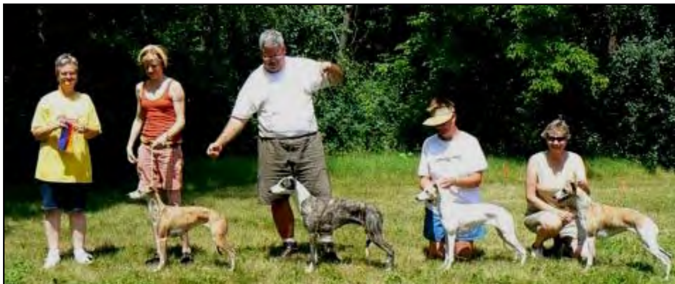
1 st : GG, 2 nd : Sly, 3 rd : Fanta, 4 th : Simmer