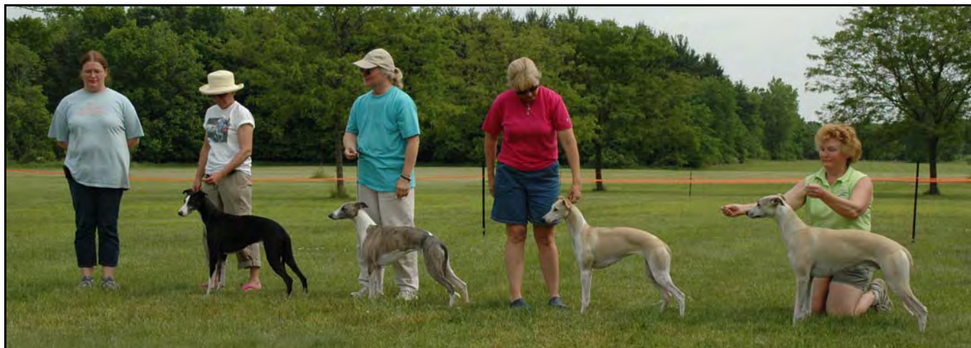
1 st : Brimstone, 2 nd : Lacy, 3 rd : Vendome, 4 th : Jack