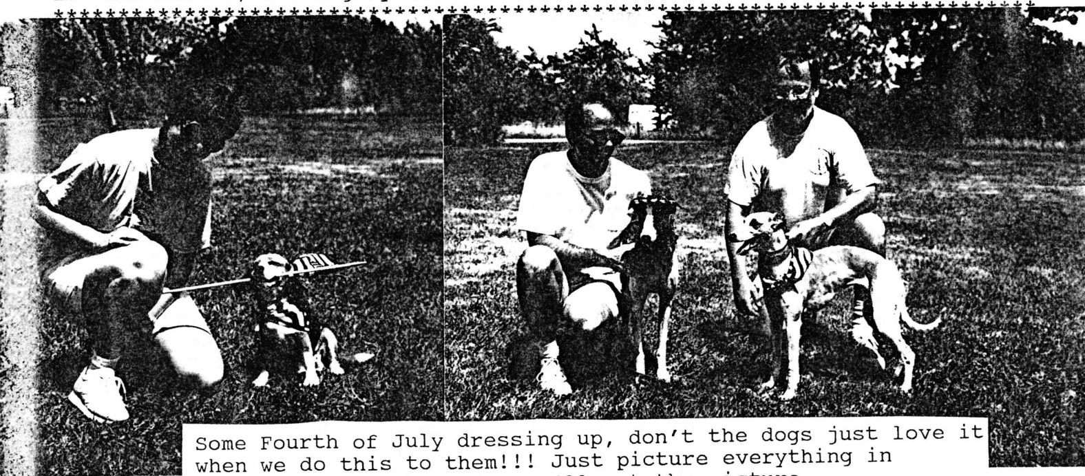
Some Fourth of July dressing up, don't the dogs just love it when we do this to them!!! Just picture everything in red, white and blue and you'll get the picture.